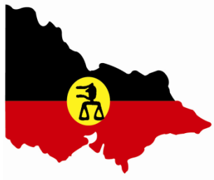
Victorian Aboriginal Legal Service Co-operative Ltd