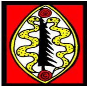
Aboriginal Legal Rights Movement Inc